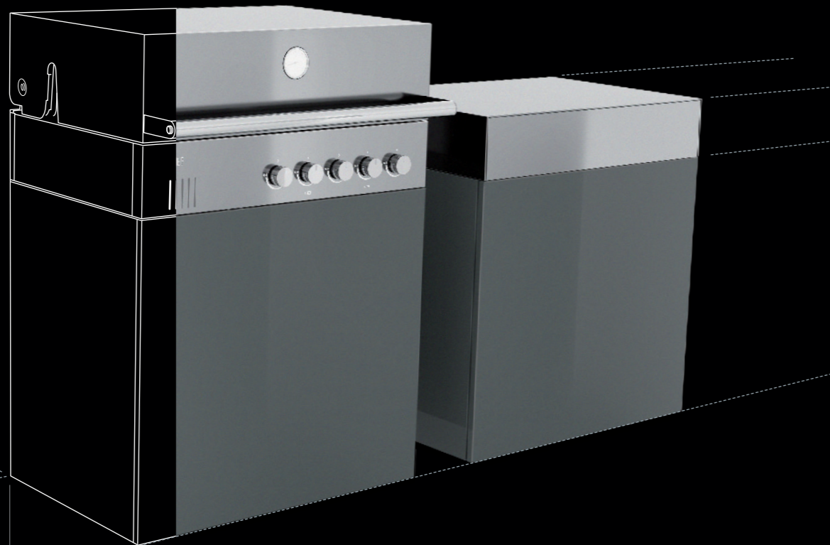
QUBE drawer head with QUBE base cabinet